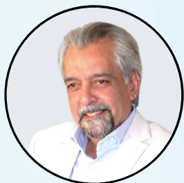
Amb @ Najm Us Saqib Former Diplomat (Pakistan)